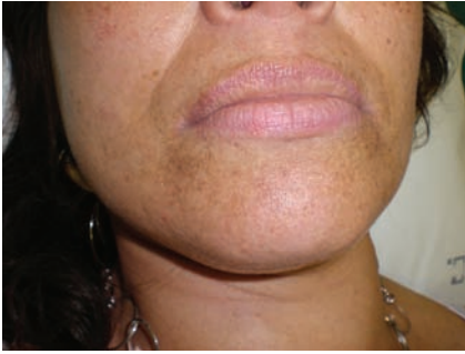
Figure 3. Hyperpigmented, ephelide-like macules around the mouth.