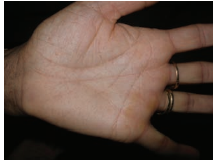
Figure 4. Palmar pits.