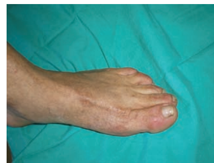
Figure 2. Hyperpigmented macules on the dorsa of the feet.