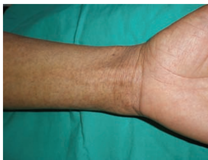
Figure 1. Hyperpigmented macules on the flexor aspect of the forearm.

The true knowledge of the relationship between RAK and DDD will be possibly achieved, through the clarification of the genetic background of both diseases.