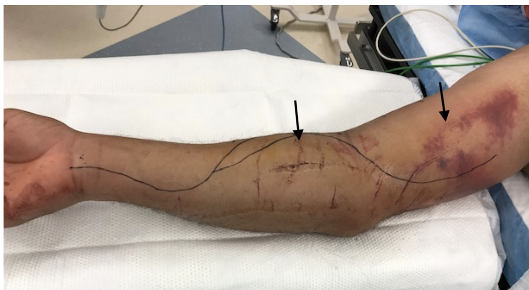
FIGURE 2: Right arm and forearm severe swelling

The patient was admitted for observation and pain control. Two days later, he was found to have severe pain in the right arm and forearm, severe swelling, and progression of the right extremity motor deficits (Figure 2). The patient also endorsed new onset of numbness, tingling and pain out of proportion to elbow flexion, or extension. On physical exam radial pulses were intact bilateral (b/l). Labs were significant for normal worsening elevation of CK to 1838.