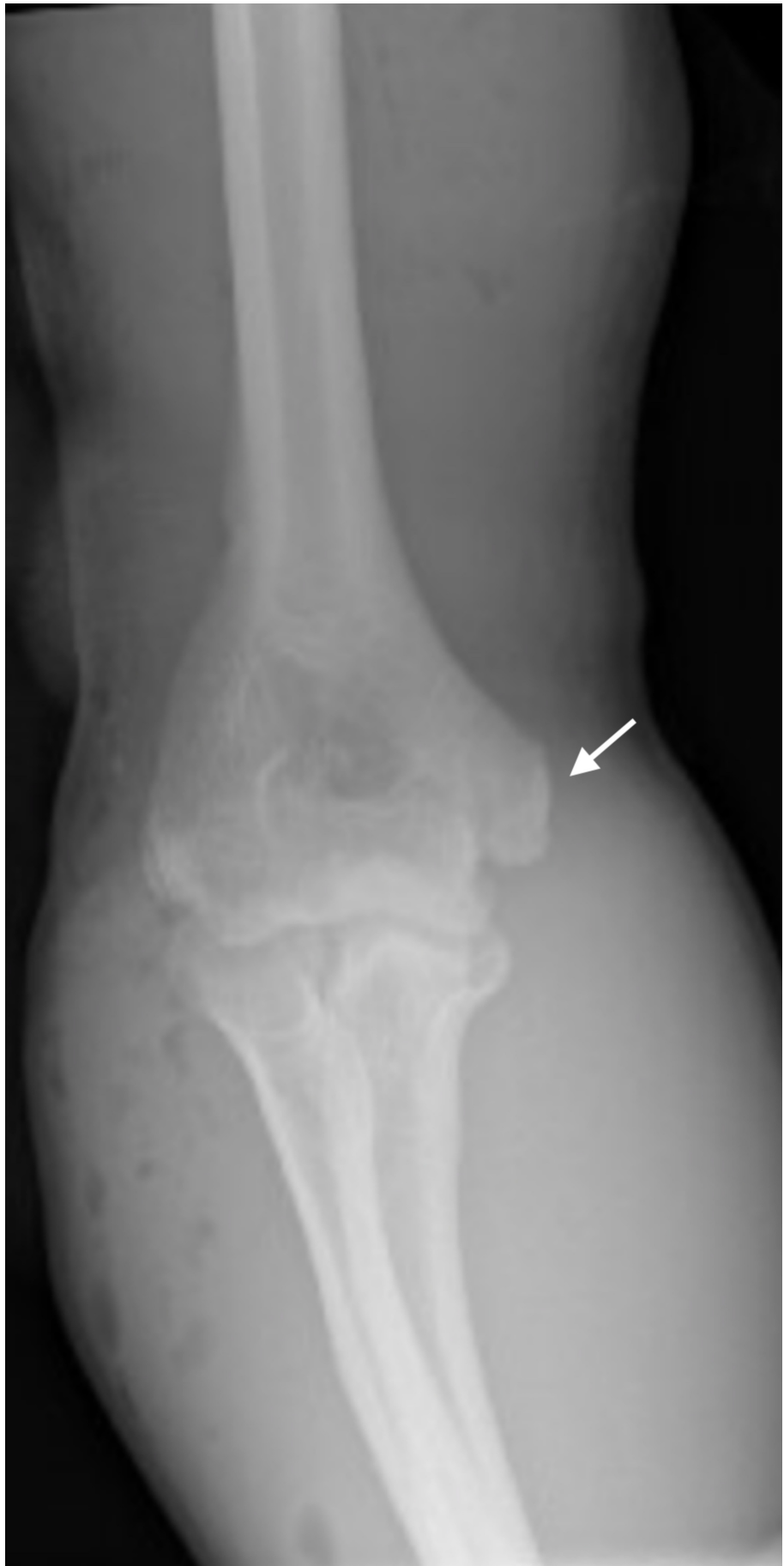
FIGURE 1: Cortical fracture of the distal humerus with adjacent