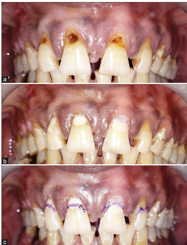
Figure 1: (a) Preoperative view. (b) After GIC filling. (c) After cementoenamel junction marking

Treating multiple gingival recessions is a challenging task for any periodontist. Initially, Allen [7] gave a supraperiosteal tunneling technique for the treatment of multiple gingival recessions. This was modified by Zabalegui et al. , [8] where they eliminated the internal bevel incision. Generally, making a supra- or subperiosteal tunneling through gingival sulcus causes problems such as difficulty in proper graft or membrane placement, increased risk of tearing, or perforation of flaps, thus leading to improper healing of marginal gingival tissues. For eliminating these problems, Zadeh [5]