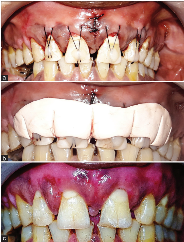
Figure 3: (a) Suturing done with 4-0 silk suture. (b) Periodontal pack placed. (c) Six-month postoperative view showing good recession coverage

introduced VISTA technique in 2011 where he has obtained the subperiosteal tunneling from maxillary frenum for the treatment of multiple anterior gingival recession defects. This initial incision prevents the scar formation, thus increasing the maximum outcome regarding esthetics. The major difference between this VISTA and others was the way of coronary advancement and stabilization of tissue by suturing. Suturing prevents the micromotion of gingival tissue that may be increased during facial movements. It reduces the muscle pull and maintains the papillary integrity as interdental papilla is not reflected (no sulcular incisions), making treatment outcomes predictable. [5] Moreover, VISTA has an additional advantage of treating multiple gingival recessions without any additional secondary surgical sites, thus eliminating postoperative pain and morbidity. In a similar way, the present case has shown predictable outcomes regarding the recession coverage and achieved good results 6 months postoperatively.