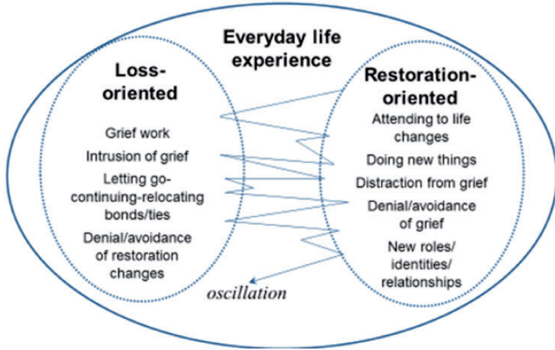
Figure 1. The Dual Process Model of Coping with Bereavement Stroebe & Schut (1999).

particularly, with respect to the deceased person (e.g., visiting the grave to be close to the deceased; looking at photos of him/her). Restoration orientation refers to secondary (to the loss itself) sources of coping with stress. RO focuses on what else needs to be dealt with as a result of the loss, and how these matters are dealt with (e.g., taking up employment to compensate for the deceased's lost income; learning skills that had been done by the deceased).