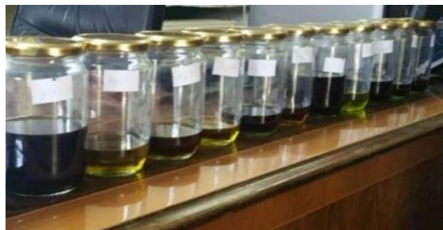
Figure 1 Plant extracts-extracted with a Soxhlet apparatus.

The M. chamomilla plants were collected in a Kosovo field in 2018. The plant was preserved in the herbarium of the Biology Department of University of Prishtina (no. 324/2018). The aerial part of the plant was air-dried and ground to a powder with a blender. The dried powder was vacuum-packed and stored at –20°C until use. Dried M. chamomilla powder (10 g) was extracted twice with 100 mL of 80% ethyl acetate (EthOAc) with a Soxhlet apparatus at boiling point, and the extract was concentrated with a rotary evaporator at 40°C (Figure 1). This extract A4(5) was stored in a deep