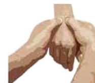
Figure 2 Standardized musculoskeletal examination procedures.

Note: The described techniques for physical examination should be performed by a trained clinician.