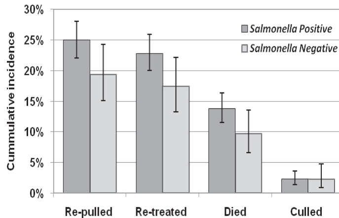
Figure 2. Cumulative incidence of adverse health outcomes occurring during the feeding period for feedlot cattle that were previously identified as positive or negative for Salmonella based on fecal culture at initial treatment for apparent respiratory disease. Percentages were derived from probability estimates from logistic regression models accounting for the arrival lot of each individual.