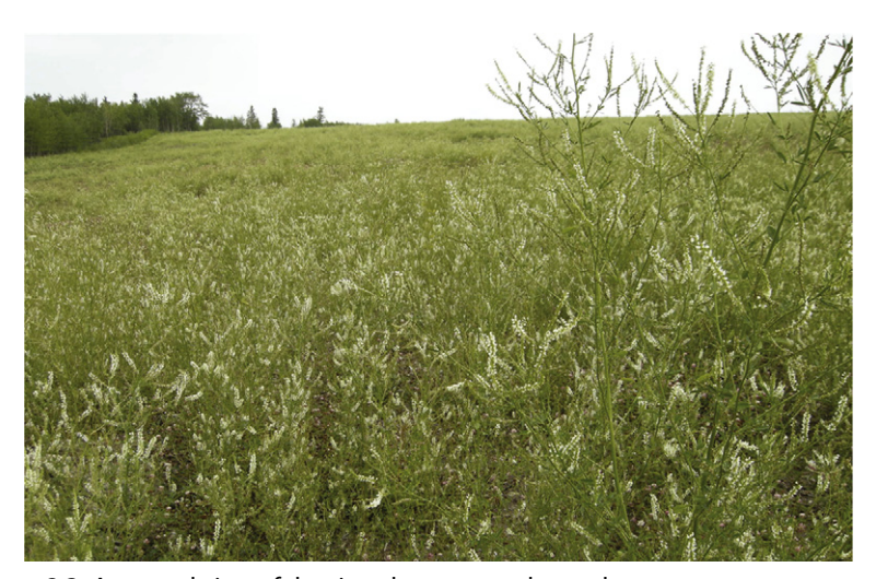
Figure 2.3 A general view of the site where sweet clover plants were grown to prevent soil erosion. This site was used to observe the natural spread of SCNMV.

Regular visual inspections and samplings were conducted, and followed by infectivity tests on the indicator plants in the greenhouse. The results indicated that SCNMV infection occurred at a rate of about 6%. The source of the natural infection remains unknown. In the past, the natural infection of a solitary sweet clover plant in the forest, roadside, or riverbanks was observed frequently and shown to test positive (C. Hiruki, unpublished data). When infected sweet clover is not disturbed, abundant seeds are shed around the plant, and the young seedlings are subsequently infected by the soil transmission of SCNMV.