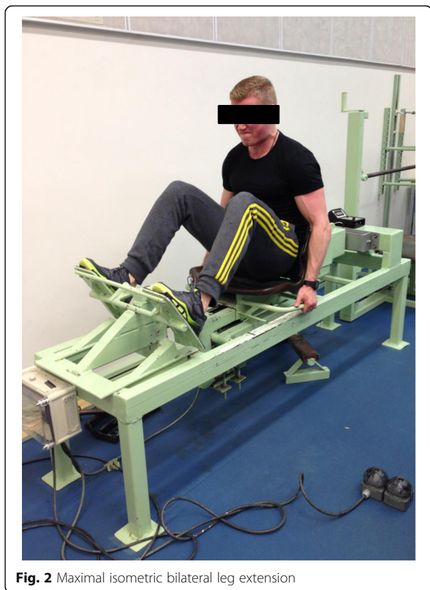
Fig. 2 Maximal isometric bilateral leg extension

measurement was recorded by an isometric strain-gauge dynamometer. A minimum of two trials were performed for each subject and the best result was selected for further analysis. This method is well documented and used in many previous studies [26, 27]. The reproducibility of measurements of maximal isometric muscle force is high ( r = 0.98 , C.V. = 4.1%) [28]. Finally, overall maximal muscle strength in the present study refers to the results of these three measurements (leg extension and trunk flexion and extension).