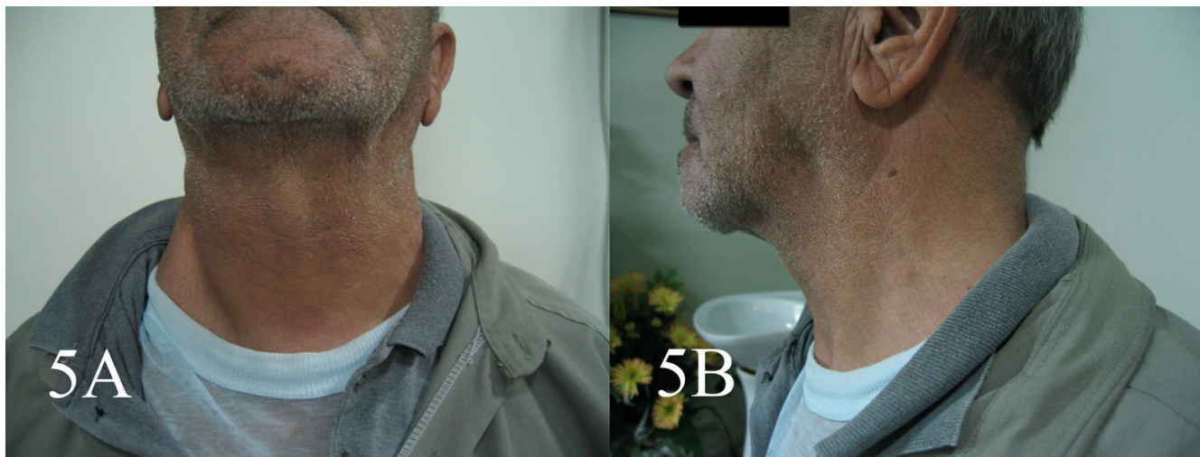
Figure 5 Complete resolution of neck swelling one week after receiving chemotherapy.