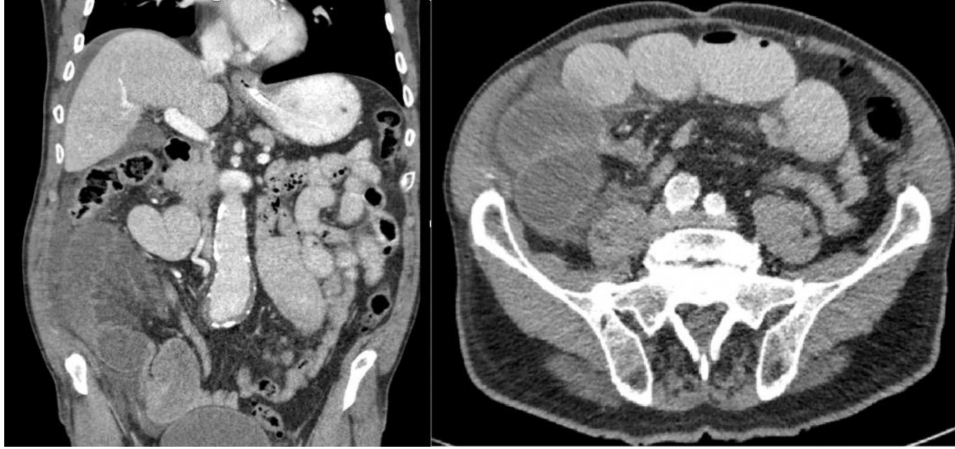
Figure 1: CT: demonstrates closed loop short bowel obstruction with dilated small-bowel loops and ascites