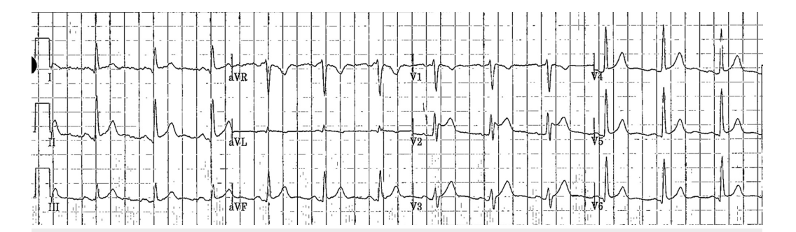
FIGURE 1: ECG on presentation

echocardiogram was performed and showed normal left ventricular ejection fraction of 55% without regional wall motion abnormality or pericardial effusion.