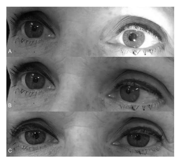
Figure 1 Anisocoria with brisk constriction to light OD and imperceptible reaction to light OS (A), with OS constriction to near greater than OD (B). 0.125% pilocarpine test demonstrates 3.75 mm OD and 3.25 mm OS, confirming the diagnosis of a left tonic pupil (C). OD, oculus dexter; OS, oculus sinister.

Trigeminal sensation to light touch, pain and temperature were intact and symmetric in V1, V2 and V3. There were no signs of cranial nerve III or VII aberrant regeneration. Knee and ankle reflexes were 2+ bilaterally. Humphrey 24-2 visual field testing was unremarkable.