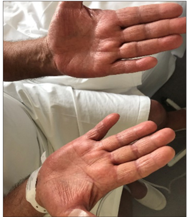
Figure 7. Resolution of the rash over the palms.

iodine contrast. Several differential diagnoses were raised, including an underlying infection process like viral hepatitis, EBV, CMV, and even COVID-19-related hives. Extensive blood tests, imaging, and PCRs were done to find the correct diagnosis. In the evaluation of the purpuric vasculitis per se, the laboratory tests that were done included a complete blood count with differentials, erythrocyte sedimentation rate, liver and renal function tests, and a urinalysis. All of these were used to exclude other vasculitis and to determine the presence of systemic diseases.