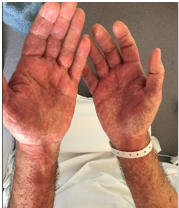
Figure 3. Maculopapular rash over the palms.