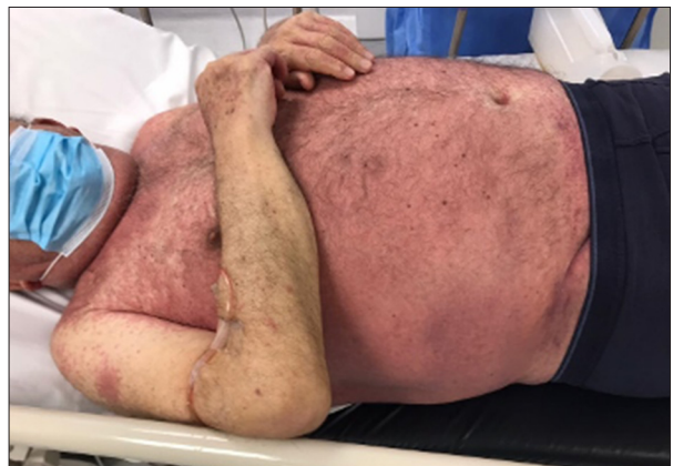
Figure 2. Maculopapular rash over the trunk.