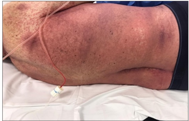
Figure 1. Maculopapular rash over the back and buttocks.

A 75-year-old man with multiple comorbidities presented to the Emergency Department with diffuse rash, itching, and facial flushing 48 hours after undergoing abdominal CT scan with iodine IV contrast and 72 hours after the beginning of a diffuse abdominal pain that encouraged his primary care physician (PCP) to order this imaging in the first place. As the pain did not resolve, the patient presented to our care with the previously mentioned symptoms and also with a fever of 38.6°C.