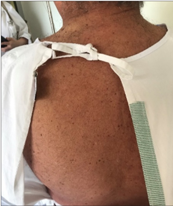
Figure 6. Resolution of the rash over the back.