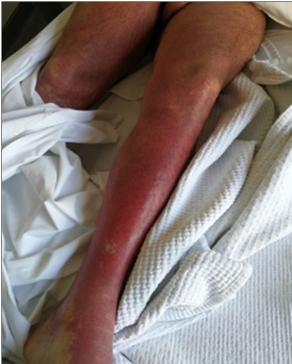
Figure 4. Purpura and petechia over the lower extremities.