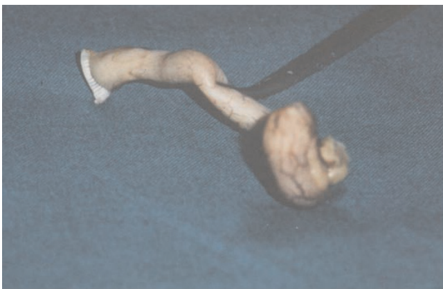
Figure 1 Intraoperatively we defined a solid, moderately hard, elastic and yellowish mass on the appendix tip, with diameter 1,0 cm.

The reported incidence of appendiceal carcinoids in several studies ranges from 0.08 to 0.7% in surgical specimens [5-8]. Willox in 1964 suggested that 0.2-0.5% of surgically removed appendices in children contained CT [9]. Doede et al [8] and D' Aloe et al [10] estimated that CTs of the appendix occur in 1:100,000 to 169:100,000