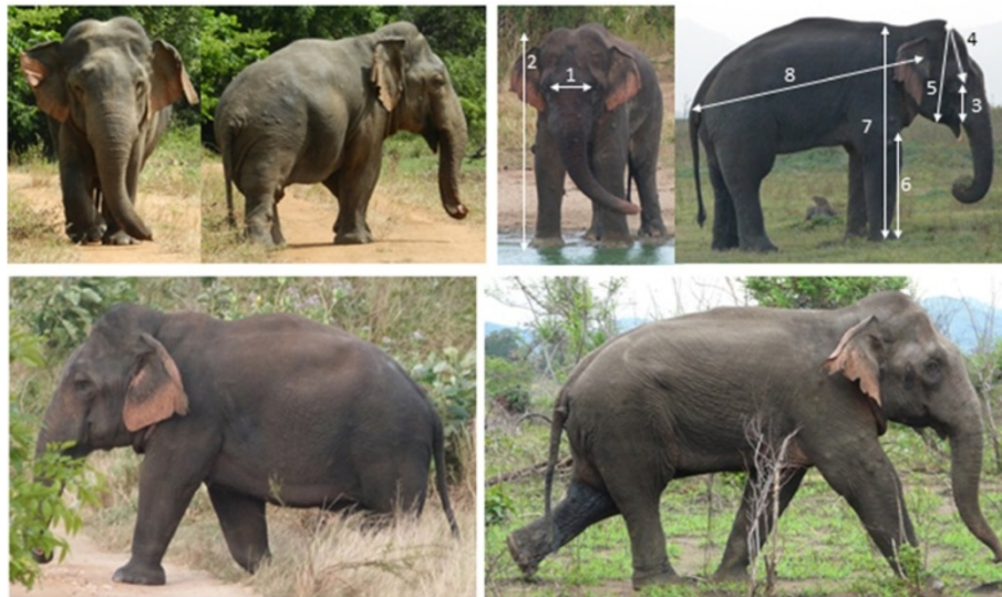
Figure 2 Dwarf M459 and wild type adult male M054. M459 (left) proposed dwarf, compared to M054 (right) a typical mature adult male. Numbers indicate ratios given in Table 1 as follows: 1) Width between the eyes; 2) Head to foot; 3) Eye to tusk sheath; 4) Top of skull to eye; 5) Top of skull to chin; 6) Foreleg length; 7) Shoulder height; 8) Body length from base of tail to ear canal.

twice this circumference. This ratio appears to remain constant throughout an individual's life [9]. The height of the subject was measured by proxy using a tree against which he had been standing.