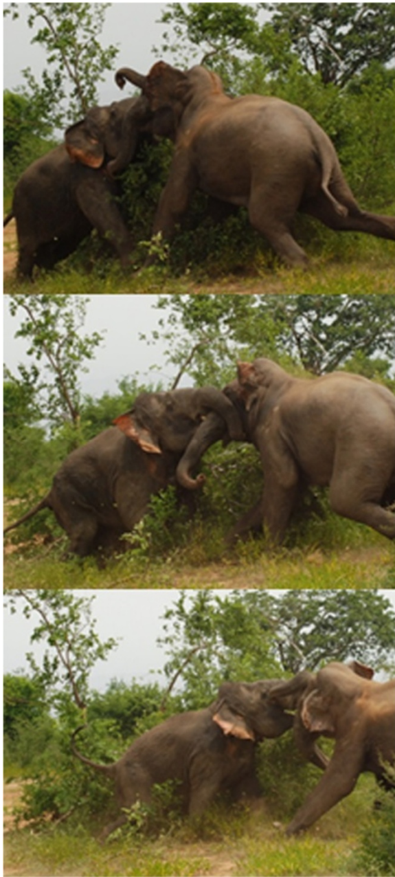
Figure 5 M459 fighting M175. This sequence shows M459 forcing M175 backward. Video can also be viewed [10].

clinically-documented studies. Since growth disturbances can clearly arise from a wide array of mechanisms, as close clinical study of this free-ranging individual are not possible, the specific cause of the dwarfism exhibited by M459 cannot be conclusively established.