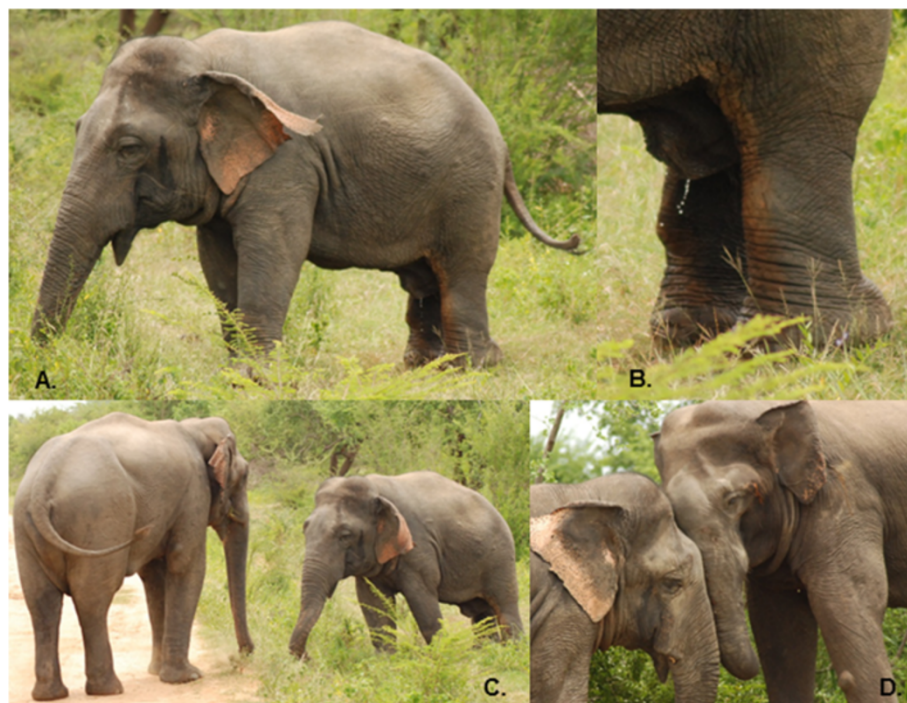
Figure 4 M459 with M175, 16 June 2014. A. M459 showing both temporal secretion and urine dribbling. B. Urine dribbling. C. M459 standing near M175. D. Head-to-head contest showing similarity of head proportions and difference in height.

The mechanisms of some cases remain as yet unknown. Friesian horses, for instance, exhibit a form of dwarfism in which both the fore and hind limbs are approximately 25% shorter relative to the breed's typical conformation, with relatively larger heads, longer hooves and hyperextension of the fetlocks [17]. The head proportions themselves appear relatively normal, similar to what is observed in M459, unlike the effects observed with disruptions to FGFR1 or FGFR2, two candidate genes found within a region of the genome that appears to be highly associated with the dwarf phenotype in this breed [18]. Nor do the documented cases resemble phenotypes resulting from disturbance to PROP1, another candidate gene within the same region, that regulates growth hormone production. Thus the causal mechanism remains an open question even in these