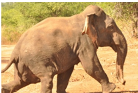
Figure 3 Dwarf M459, July 12th 2012. Subject shows no visible signs of musth, but swellings on the rear limbs similar to those observed in 2013 (Figure 2) are evident, indicating that these are old.

In order to compare the subject's physical stature to those of typical bulls, we assessed these proportions using photographs of known individuals (Figure 2). We used two views, anterior and lateral. The anterior view was used to determine a single ratio: height from top of head to toes vs. width of the distance between the eyes. The lateral view was used to calculate multiple ratios from the same photograph: the distance from the top of the skull to the eye, the eye to the base of the upper lip