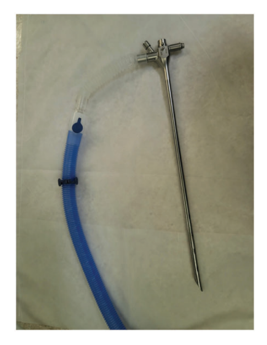
Figure I. The heated tube of the Optiflow<sup>TM</sup> was connected to the bronchial tube. The colour version of this figure is available at: http://imr.sage pub.com.

In December 2020, a 61-year-old female with diabetes mellitus was diagnosed with necrotizing aspergilloma in the left upper lobe of the lung and scheduled for bronchoscopic removal of the obstructing endobronchial lesion in the Department of Anaesthesiology and Pain Medicine, Soonchunhyang University Bucheon Hospital, Soonchunhyang University