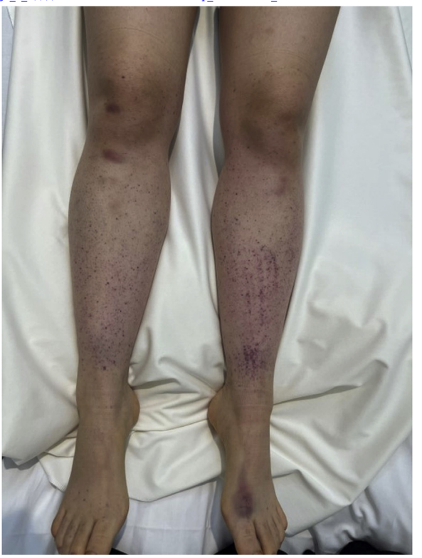
Fig. 1. Purpuric lesions on the patient's lower legs.

2: Magnr#ext,,,,-::FMmexFraMennFFametFfamyOunder"Main Frame