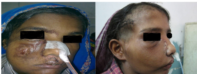
Fig. 3. Showing post-op picture of both patients.

As per the best of our research and going through the literature, our first case of a 9 year old girl is the first case in English literature presenting with two simultaneous neurilemmomas involving maxilla.