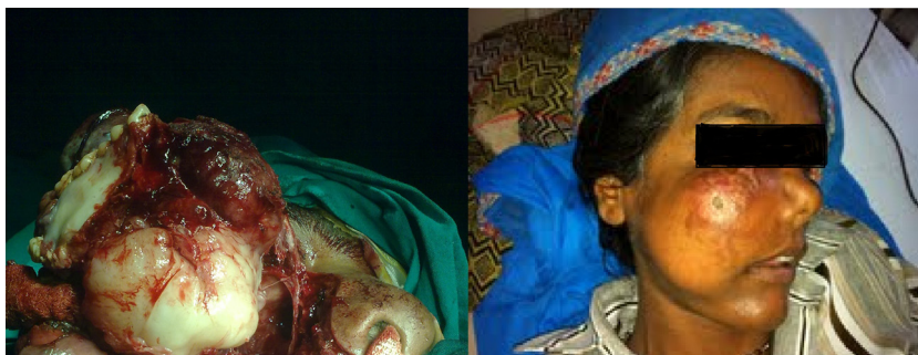
Fig. 2. Showing pre and intra-operative picture of 2nd patient.

cavity over the right gingivobuccal sulcus. There was no associated abnormality of vision or chewing.