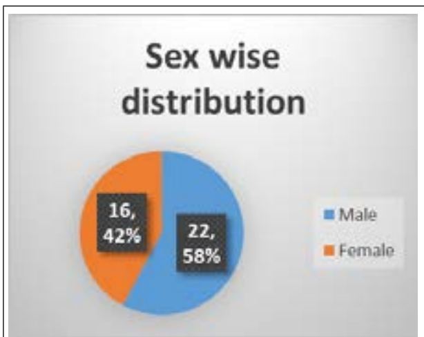
Figure 1. Sex wise distribution.