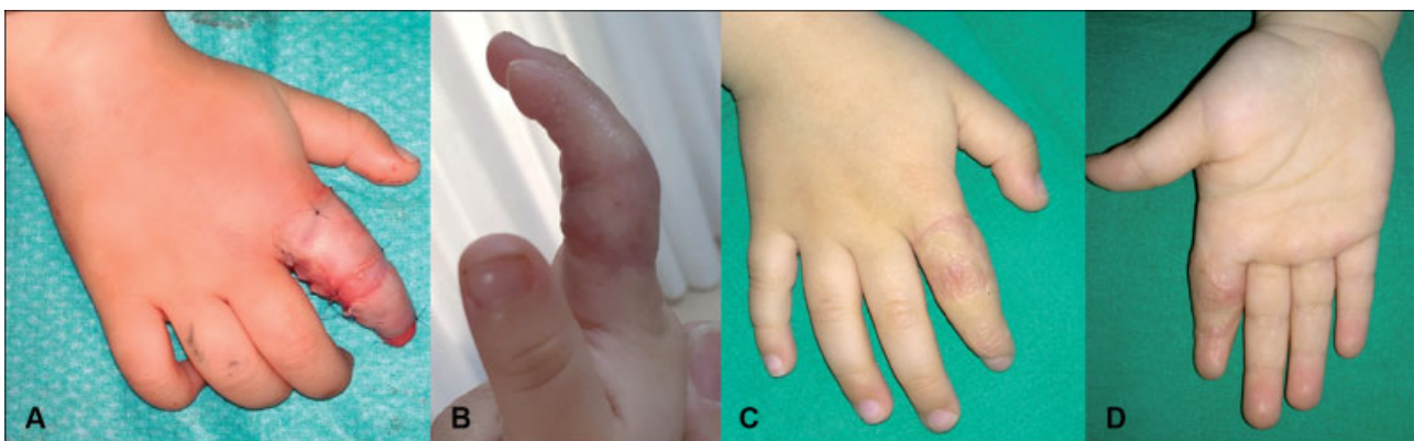
Fig. 2 Treatment of the sequelae. (A) Immediate postoperative result after surgical debridement of the burn on the dorsum of the finger and escharectomy of the ischemic eschar at the base and grafting with partial-thickness skin grafts. (B) Severe palmar contracture of the digit at 3 months follow-up. (C) Dorsum of hand at 8 months follow-up, after surgically releasing the contracture and grafting with full-thickness skin graft. (D) Palm of hand.

Any pathologic condition that increases the volume inside a closed compartment (intrinsic causes, such as bleeding or edema after a fracture) or limits the external dilation of the