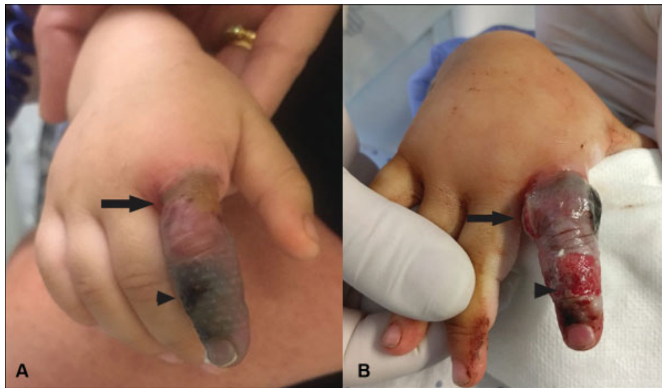
Fig. 1 (A) Ischemic circumferential constrictive eschar at the base of the finger (black arrow), secondary to compressive dressing, with severe vascular compromise of the finger. Arrowhead: burn lesion. (B) Immediate recovery of distal perfusion after emergent bilateral escharotomies (black arrow) were performed. Arrowhead: debrided burn.

several minutes before. She presented a noncircumferential, superficial partial-thickness burn on the dorsum of the mid phalanx of the second finger of her right hand. A compressive dressing was applied solely to the affected finger. Forty-eight hours afterward, the patient presented at the emergency room with severe pain of the finger. After removal of the dressing, a circumferential constrictive eschar was observed at the base of the finger, secondary to ischemia due to the compressive dressing, which generated a significant compartment syndrome with severe vascular compromise of the finger (→Fig. 1A). Emergent bilateral escharotomies were performed, with immediate recovery of distal perfusion (→Fig. 1B). One week afterward, the patient underwent surgical debridement of the burn on the dorsum of her finger and escharectomy of the ischemic eschar at the base. The lesions were covered with split-thickness skin grafts, the donor site being the ipsilateral arm (→Fig. 2A). As soon as the graft healed, the patient was started on splinting and physi-