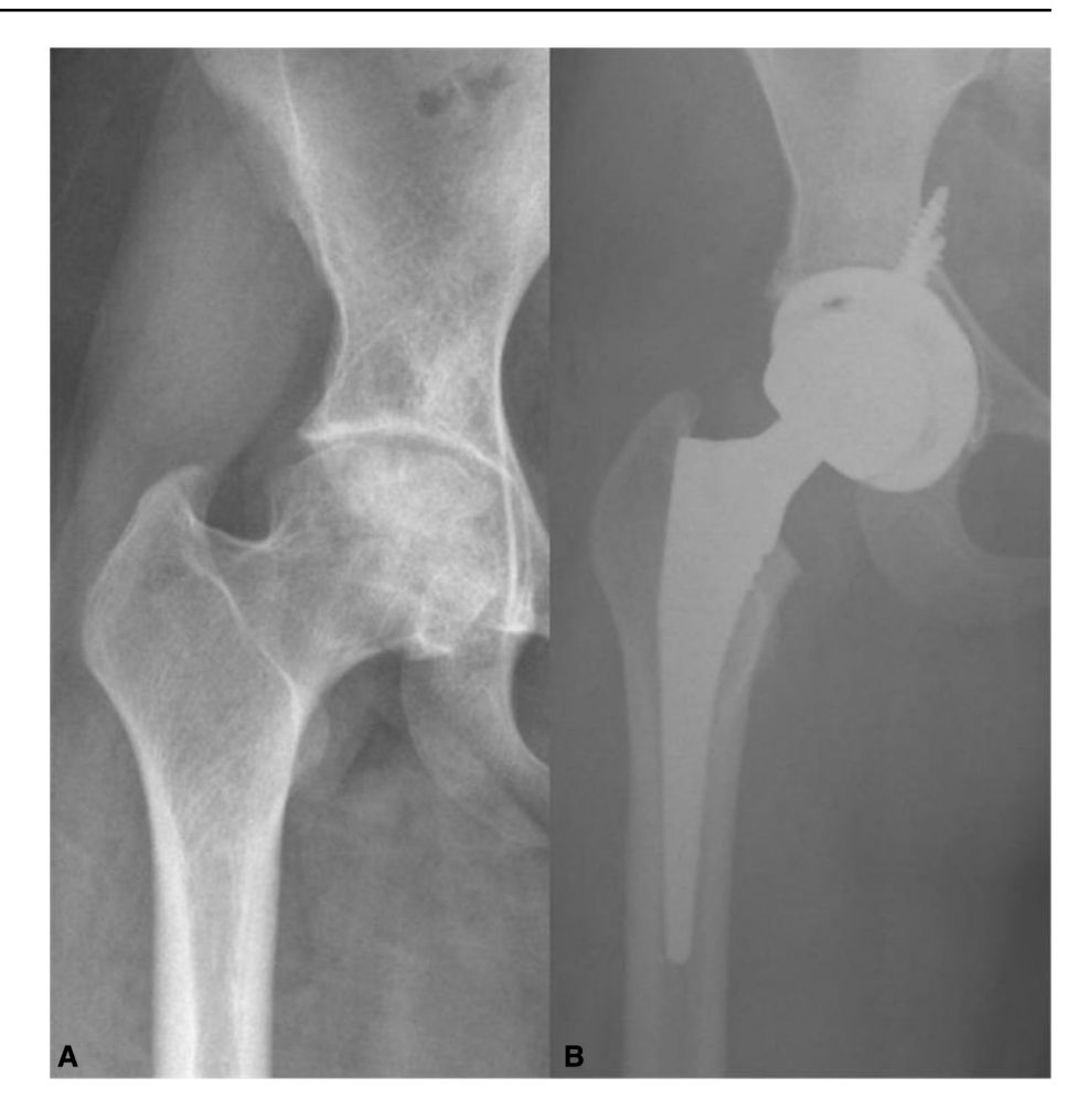
Fig. 2 a Hip joint with preserved acetabular congruency pre-operatively. b Post-operative hip joint with prosthesis