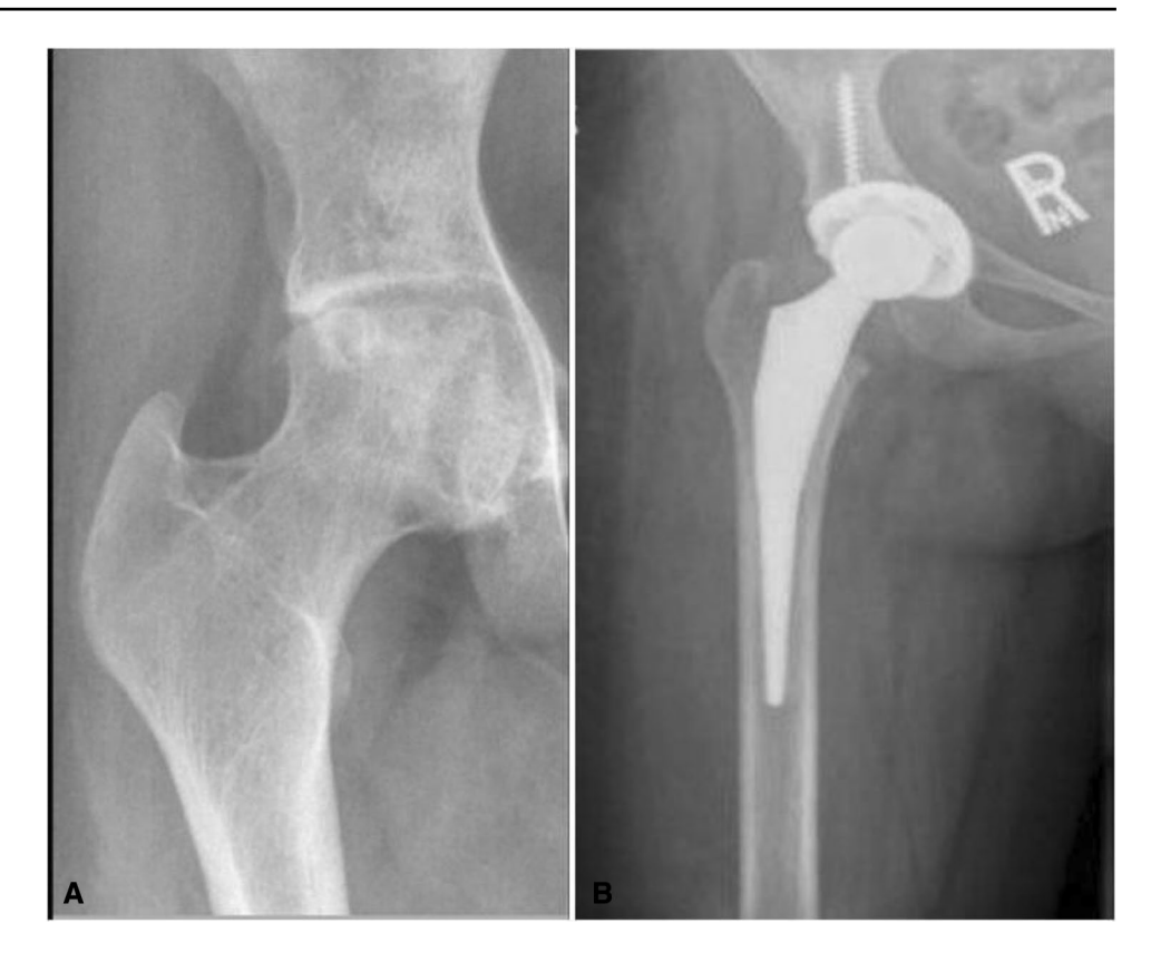
Fig. 1 a Hip joint with subchondral collapse with a triangular shape and loss of acetabular congruency pre-operatively. b Post-operative hip joint with prosthesis

trochanter and on to the femoral neck led to the capsule of the gluteus minimus that was released from the anterior greater trochanter, allowing easy dislocation of the hip joint. Adequate exposure and meticulous soft-tissue handling were done to avoid complications or fracture. Extra precautions were taken while femoral stem preparation in patients with sclerotic and narrowed femoral canal. Sequential reaming over guidewire was done to prevent femoral stem perforation.