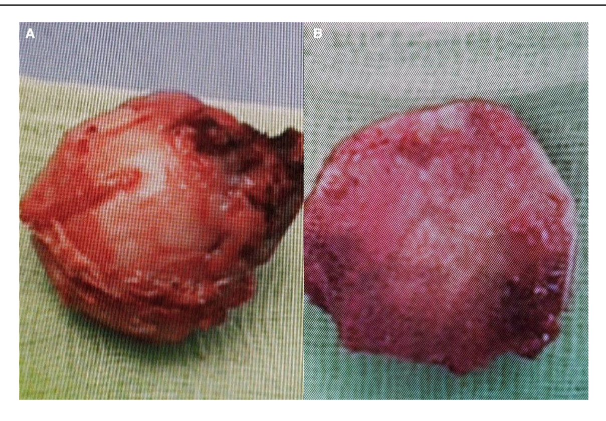
Fig. 3 Post-surgical observation of the head of the femurs. a Roundhead of the femur. b Triangular head of the femur