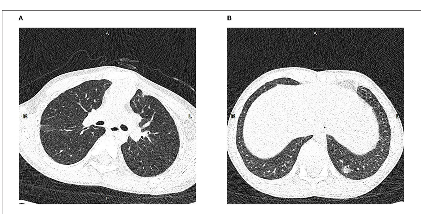
FIGURE 2 | Computed tomography of the chest in the axial plane. (A) On hospital Day (HD) 1, showing slight inflammation in the middle lobe of the right lung and upper lobe of the left lung. (B) On HD 7, showing little emerging flaky exudation in the posterior basal segment of the left lower lobe.