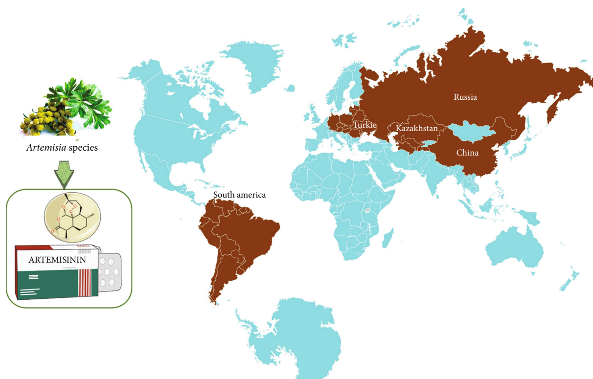
FIGURE 1: Geographical distribution of Artemisia species.

be used for the treatment of neurodegenerative diseases such as Alzheimer's or Parkinson's due to its inhibitory action on the production of neuroinflammatory mediators in BV2 microglial cells and the reactive oxygen species (ROS) production; leading to inhibitory effects on the activations of protein kinase C (PKC) and c-Jun N-terminal kinase (JNK) [116].