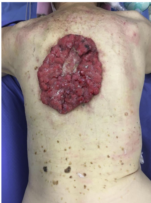
Fig. 1. Preoperative view of the giant basal cell carcinoma of the back measuring 16 × 13 cm.

tally found when the patient was taken to her general practitioner for increasing fatigue. Physical examination revealed a bleeding lesion with granulation tissue and copious serous drainage. Blood test findings revealed severe iron deficiency anemia (Hb 6.8 g/dl) and hypoproteinemia (Albumin 1.8 g/dl), probably due to intermittent bleeding of the tumor and serum loss. Preoperative punch biopsies of the lesion were positive for Basal cell carcinoma, and total body computed tomography (CT) scanning demonstrated the mass to be confined to the skin and subcutaneous fat while no evidence of lymphadenopathy or metastatic disease was observed.