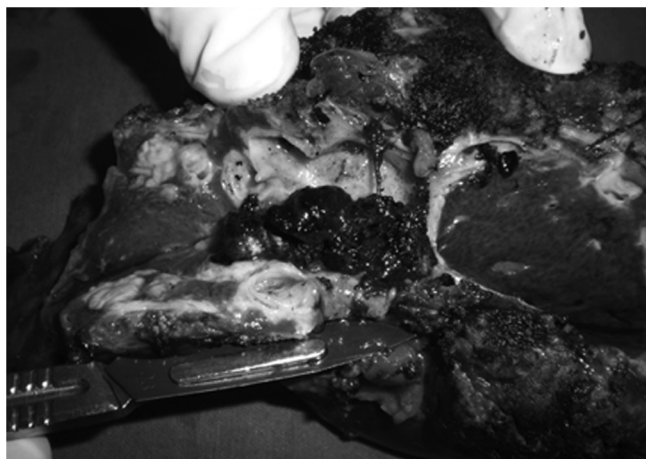
Fig. 2. Left lobe parenchyma presenting dilated bile ducts with multiple intrahepatic stones.

25 IU/L; alkaline phosphatase (ALP): 372 U/L; blood urea nitrogen: 17 mg/dL; creatinine: 0.5 mg/dL; sodium: 137 meq/L; potassium: 3.3 meq/L. The diagnosis of acute cholangitis was considered and a broad spectrum antibiotic was started. Subsequent abdominal MRI showed hepatomegaly with diffuse dilated intrahepatic ducts (Fig. 1). Intrahepatic stones, biliary strictures and hepatic abscesses were identified in both lobes of the liver, especially in the left segments.