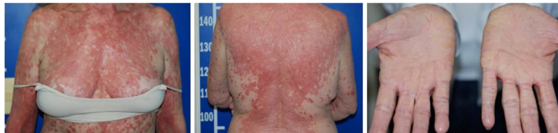
Figure 2 Confluence of the lesions and evolution to erythroderma, with areas of healthy skin. Note the palmar involvement with orange keratoderma.

The association of PRP with the use of imiquimod in the treatment of actinic keratosis and superficial basal cell carcinoma has been reported in three articles. This report describes a case of PRP during the use of imiquimod for actinic keratosis, with a good response to treatment with methotrexate.