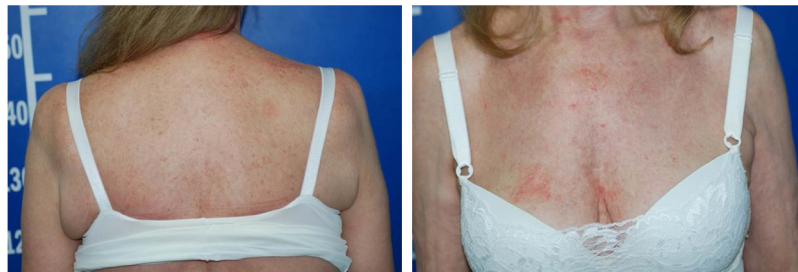
Figure 4 Disease resolution after nine months.

biological agents with anti-tumor necrosis factor- \alpha , anti-interleukin-17, and anti-interleukin-23 activity. 1,2