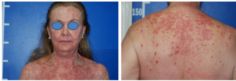
Figure 1 Eruptive erythematous papulosquamous lesions on the trunk and cephalic segment.