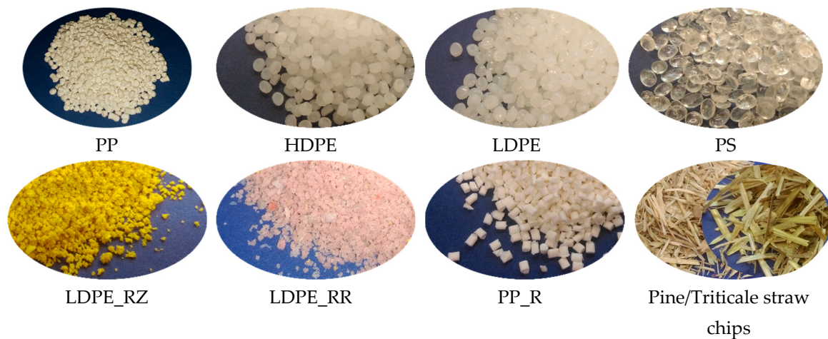
Figure 1. The photographs of the fillers.

dimensions of triticale particles were 17.8 mm in length, 2.55 mm in width, 0.30 mm in thickness, and for the pine chips, they were 13.73, 2.03, and 1.04 mm, respectively. A detailed dimensional analysis is presented in our previous publication [25]. The pine chips were industrial chips intended for core layers of three-ply P2 boards. Visual inspection confirmed disparate morphology of the fillers. The fillers are shown in Figure 1. The pre-selected material was sorted on a sieve with a mesh size of 0.5 mm in order to separate fine particles and silty fractions. Figure 2 presents the results of the sieve analysis.