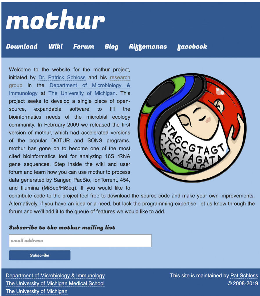
FIG 2 mothur homepage. From the mothur home page at www.mothur.org , users can download mothur, access a user forum, navigate a wiki with extensive documentation, find blog posts that provide additional examples of how to use mothur, join the mothur Facebook group, and subscribe to the mothur mailing list.

and ARB/SILVA's aligners were not open source or publicly available. Thus, we realized that such an important functionality needed to be open to the community (43). More recently, the rejection of closed-source, commercial tools can be seen by the broader adoption of open-source alternatives. This has been the case with the rising popularity of VSEARCH over USEARCH within the microbial ecology community (55, 56).