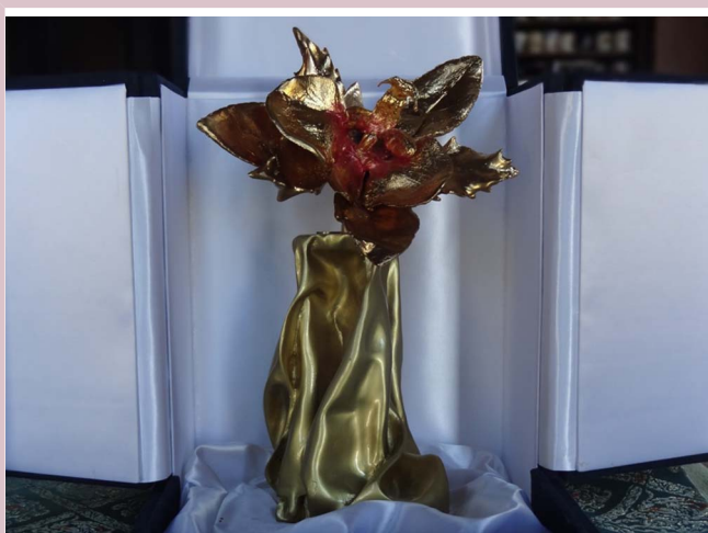
Figure 1 The Flower of Hope—the ESMO Lifetime Achievement Award.

was then fundamentally renewed to establish a system for the board certification of medical oncologists in Japan. For this purpose, JSGMO was renewed as JSMO in 2002. At the first meeting, approximately 600 members attended and discussed future perspectives in Medical Oncology. The infrastructure of JSMO was consolidated to enable the realisation of examinations for the board certification of medical oncologists. For example, JSMO provides CME credit for attending educational events. In addition to its annual scientific meeting, JSMO organised educational seminars twice a year for developing essential knowledge of Medical Oncology, and a best of ASCO meeting as an advanced course. At both activities, 500–800 investigators attended. JSMO published two textbooks on medical oncology, one for undergraduate students: INTRODUCTION OF MEDICAL ONCOLOGY 6 and another for young