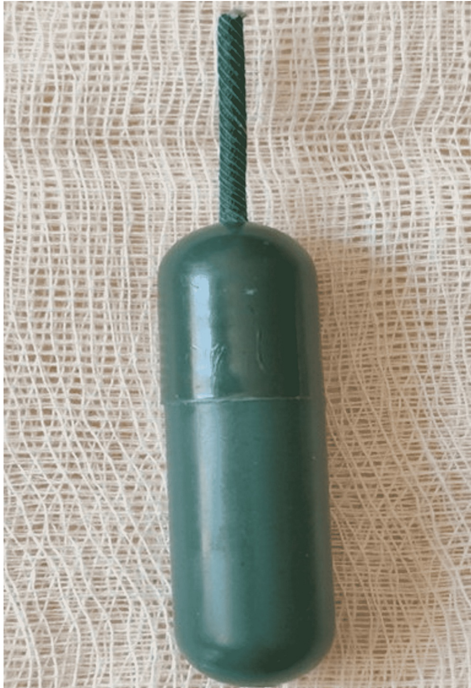
FIGURE 3: View of the torpedo-shaped firecracker that caused the injury

The cavity formed by the FB was irrigated with physiological saline and the incision line was sutured. The patient was discharged on the same day after the prescription of amoxicillin-clavulanate (1,000 mg tb; 2x1 p.o) and paracetamol (500 mg; 3x1 p.o). The patient had no complaints during the first week of check-up. The patient has been followed for three months and no complications have developed. Informed consent was obtained from the patient.