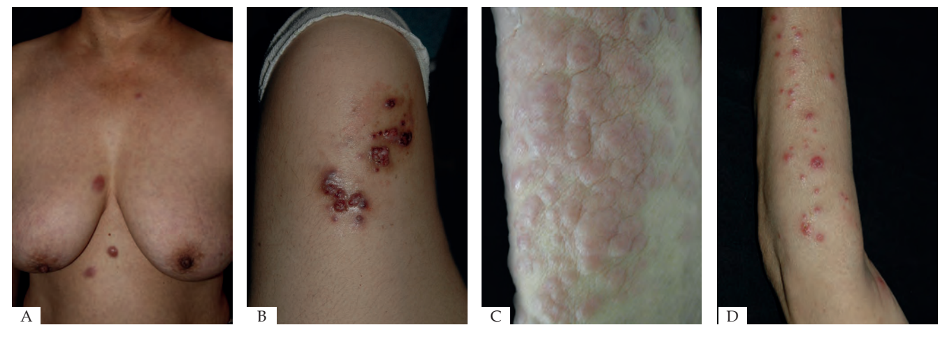
FIGURE 1: A - Scattered dark red papules without coalescence on chest and abdomen; B - Ulcerated and crusted tumor on left thigh; C - Multiple nodules on limb; D - Scattered bright red papules with ulcers and crusts on left upper extremity