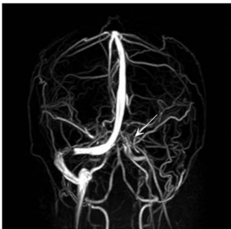
Figure 3. Magnetic resonance venography illustrating the absence of flow in the straight sinus and bilateral transverse sinuses (white arrow).

vaccinated with the second dose of the AstraZeneca COVID-19 vaccine at ~1 month prior to his admission.