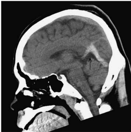
Figure 2. Lateral view of the computed tomography scan of the head illustrating an abnormal hyperattenuation (arrow) in the straight sinus and bilateral transverse sinuses.