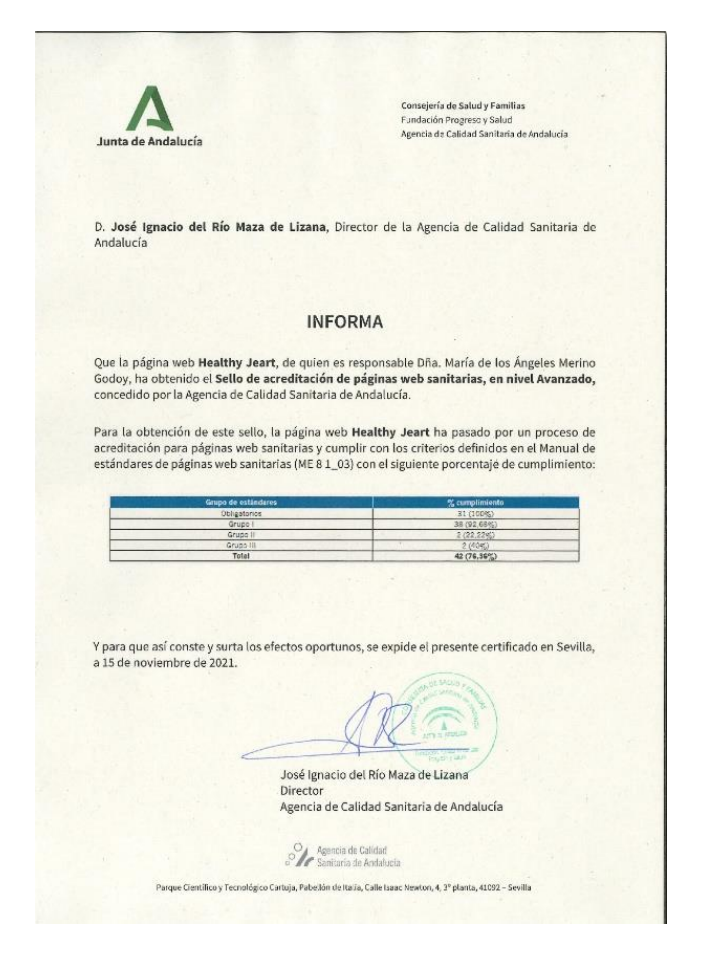
Figure A2. Advanced Level Accreditation for Web Pages.