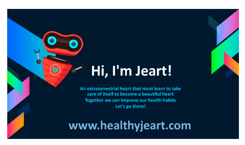
Figure 1. Presentation of Healthy Jeart.

Our goal is to promote the use of this simple, entertaining, easy-to-use, and scientifically rigorous mobile application called Healthy Jeart (Figure 1) as a health education resource in educational centers of the regions that participate in this activity. This application is currently being evaluated by the Health and Education Council of the Government of Andalusia to be include as a tool within the program of healthy habits taught in school centers, entitled "Growing in health" in the case of primary education and "Young Shape" in the case of secondary education. To this end, the Andalusian Agency for Health Accreditation (ACSA) processed a series of actions, obtaining the distinction of "healthy App" (Appendix A). The purpose of Heathy Jeart (Figure 1) is to educate the child-youth population aged 8–16 years in healthy habits.