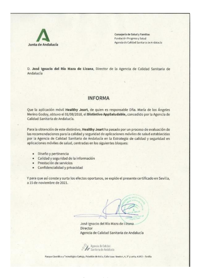
Figure A1. Distinction of "Healthy App".