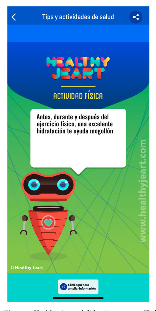
Figure 4. Healthy tips and didactic resources. "Before, during and after physical exercise, an excellent hydration helps you a lot".

The administrators can create health challenges that the educational centers can join. These challenges have a start and finish date. The participants of each center will receive points if they complete them (Figure 4).