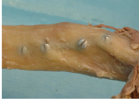
FIGURE 2: Bone ingrowth and on-growth onto metallic hardware in the humerus (cadaveric specimen). Due to a greater extent of osseointegration, greater removal torques will be necessary to extract the bone screws.

more complete, greater removal torques contributed to the failure of titanium alloy screws in this series [17]. Given these properties, we postulate that over longer periods and increased loading cycles, the development of microfractures and osseointegration contributed to screw breakage during implant removal.