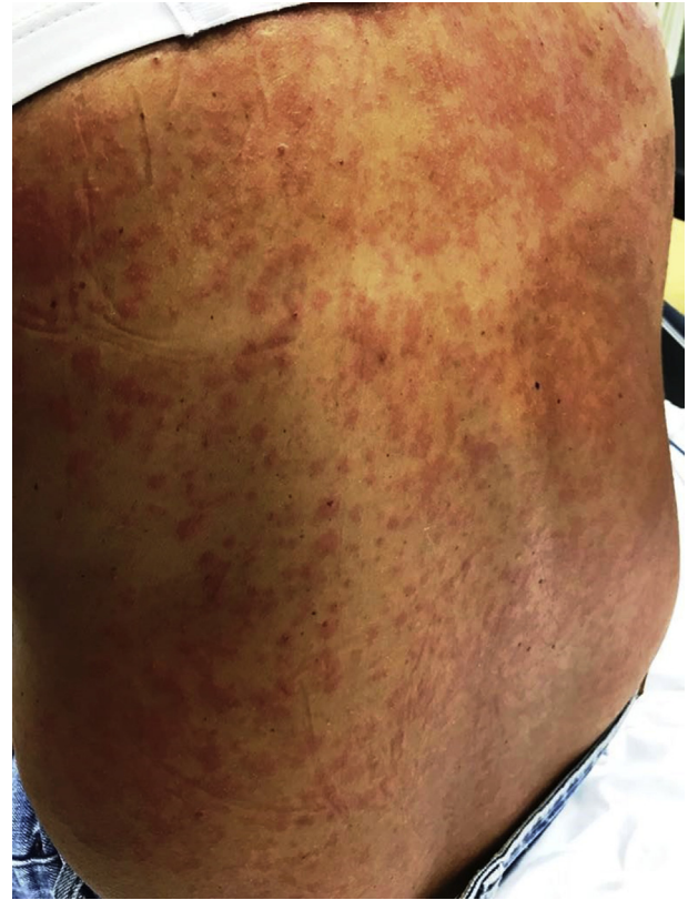
Figure 2. Maculopapular rash on the back of patient 2.

The questionnaire was sent to 377 HCP of which 269 (71%) returned the questionnaire. Of these 269 responders, 42 (16%) were protected since they were born before 1965. One hundred and forty-eight (55%) HCP were protected since they had received two vaccinations (117 persons) or they were seropositive (20 persons) or had been through a measles infection before (11 persons). In total, 71% were protected against measles infection.