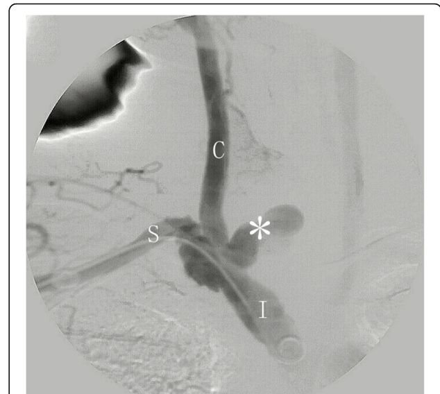
Fig. 2 Digital subtraction angiography identifies that the rupture lesion is at the innominate bifurcation and initial of the right common carotid artery. * lesion, C right common carotid artery, I innominate artery, S right subclavian artery

Before the intervention, a monitor was used to make sure our patient's vital signs were stable. Cardiac type B ultrasound evaluated that her cardiac function was normal. No