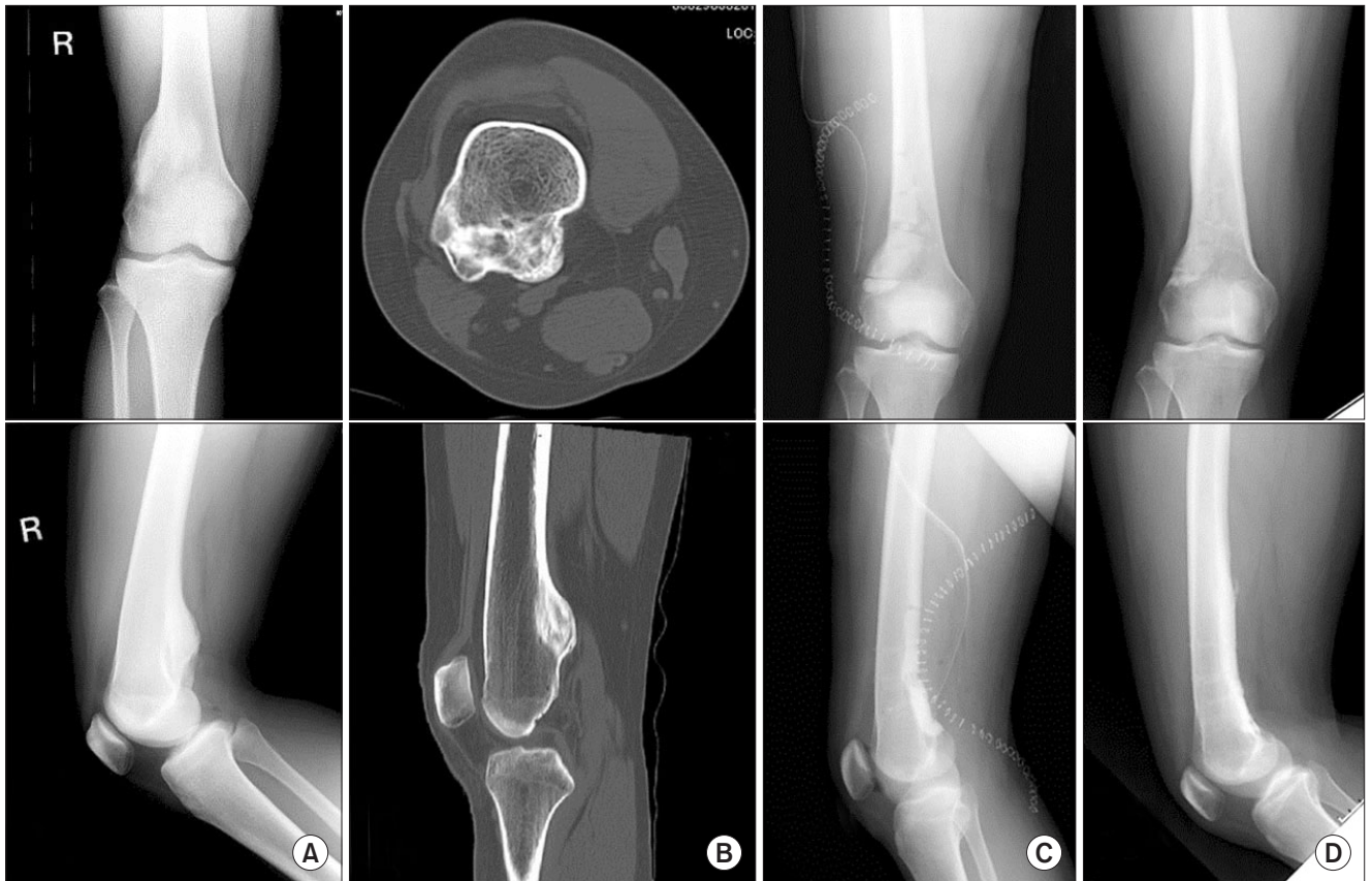
Fig. 3. Parosteal osteosarcoma in the distal femur of a 19-year-old female. (A) Plain radiographs. (B) Computed tomography scans show ossified bony protuberances from the posterior surface of the femur. (C) En-bloc resection was performed and the reconstruction method involved the use of hard-type \beta -tricalcium phosphate ( \beta -TCP) blocks and the unsintered hydroxyapatite and poly-L-lactide composites. (D) No displacement of the \beta -TCP blocks was observed and the \beta -TCP blocks were incorporated into the host bone 21 months after the surgery.