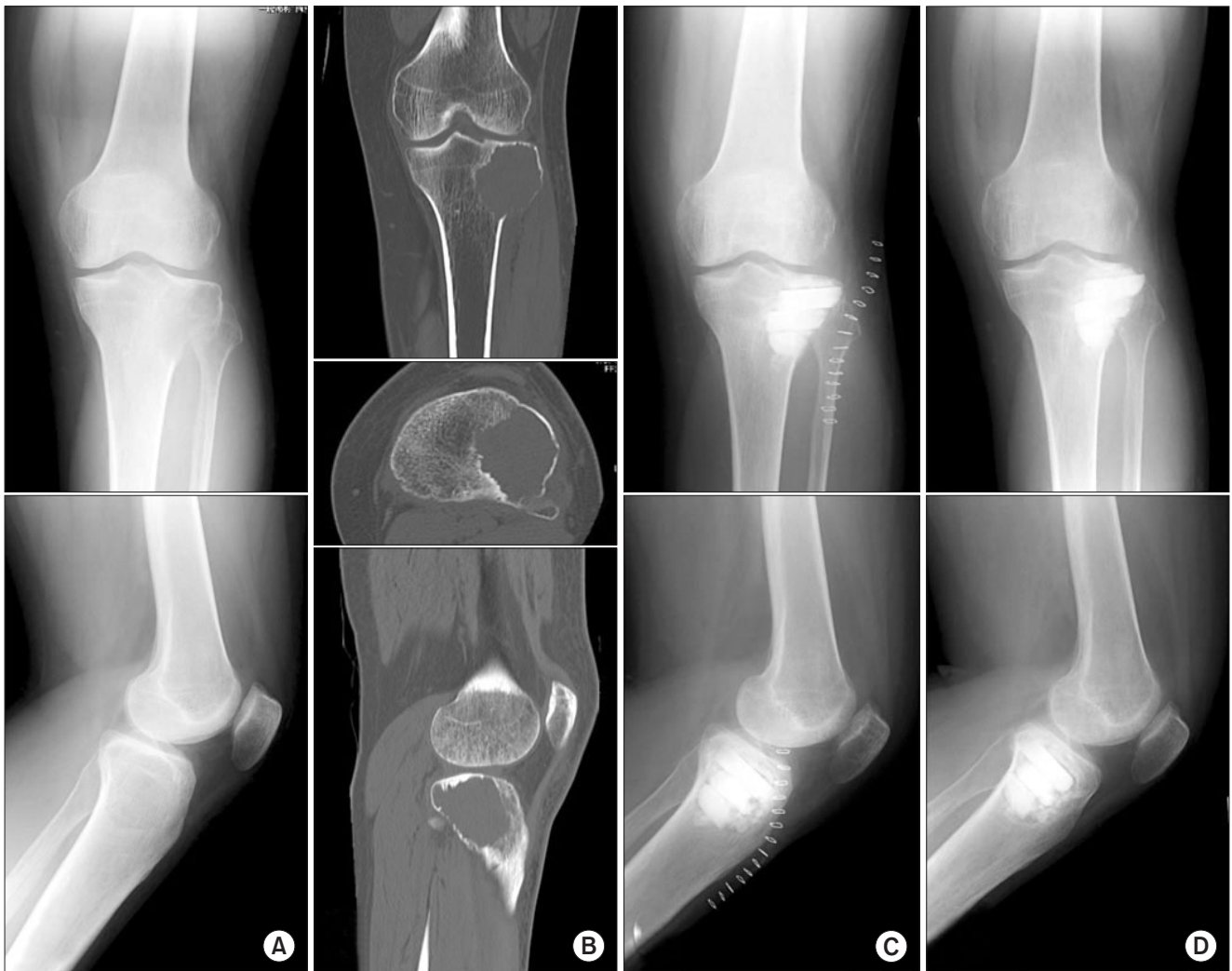
Fig. 4. Giant-cell tumor of bone in the proximal tibia of a 36-year-old male. (A) Plain radiographs. (B) Computed tomography scans show an osteolytic and expansile lesion. (C) Immediate postoperative plain radiographs show reconstruction with a hard-type \beta -tricalcium phosphate ( \beta -TCP) block. (D) Bone incorporation at the periphery of the \beta -TCP block is seen 3 months after the operation.

Both cases that involved the metaphysis were giant cell tumors of bone. Plain radiographs and CT showed an osteolytic and expansile lesion. The reconstruction method has been reported. 2) After curettage of the lesion, block-shaped hard-type \beta -TCP for the cavity, and standard \beta -TCP particles to fill in additional space were used. In both cases, to increase the potential for success of the \beta -TCP reconstruction method, u-HA/PLLA plates and screws were used to stabilize the implanted \beta -TCP block