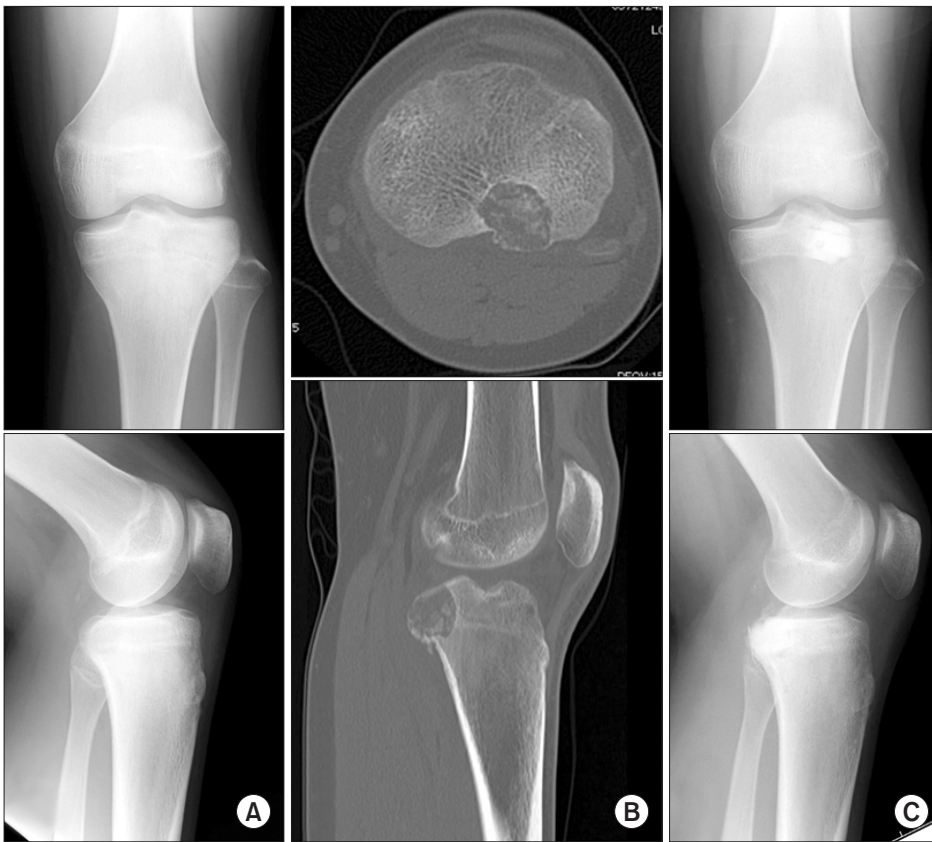
Fig. 5. Chondroblastoma in the proximal tibia of a 16-year-old male. (A) Plain radiographs. (B) Computed tomography scans show an osteolytic lesion with calcification. (C) After curettage, reconstruction was performed with a \beta -tricalcium phosphate block and unsintered hydroxyapatite and poly-L-lactide composites.

(Fig. 4). In a 36-year-old male with a 4 cm-giant cell tumor of bone in the proximal tibia, three \beta -TCP blocks, a \beta -TCP plate and two u-HA/PLLA screws were used. In a 48-year-old male with a 3.5 cm giant cell tumor in the distal tibia, three \beta -TCP blocks, a \beta -TCP plate and a u-HA/PLLA screw were used. Rehabilitation was the same as that reported elsewhere, 2) in which the patient used two crutches to avoid a weight bearing load greater than 5 kg. Weight bearing was allowed about 3 weeks after surgery when bone incorporation was recognized by vagueness of the \beta -TCP particles and new bone was apparent on the plain radiographs. Full range of motion of the knee and ankle in each case was achieved, and normal gait ability was regained in both cases by 6 months after the operation.