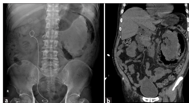
Figure 2: (a) KUB and (b) computed tomography scan of a 49-year-old male with left side severe emphysematous pyelonephritis (class 3B), large amount retroperitoneal gas accumulation and kidney destruction

The duration of antimicrobial therapy is another important issue. Unfortunately, there is currently no report on the duration of antibiotics specifically for EPN. But we can still find the answer in the literatures about urinary tract infections. According to the treatment guidelines of the European Association of Urology on urological infections [27], EPN can be classified as complicated urinary tract infection or urosepsis. In these two groups, treatment for 7–14 days is generally recommended. But the duration should be closely