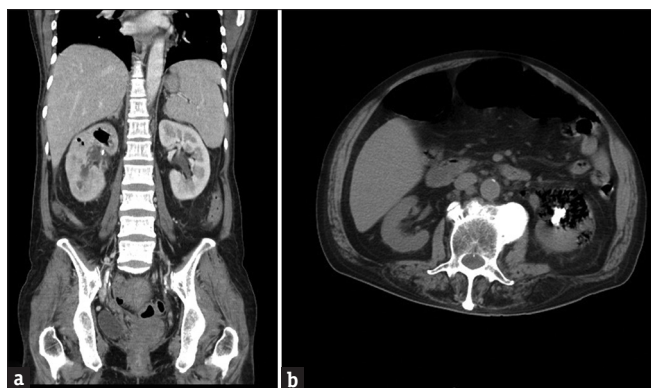
Figure 1: (a) Computed tomography scans of a 55-year-old female with right side class 2 emphysematous pyelonephritis; (b) Computed tomography scan of a 68-year-old male with left side class 2 emphysematous pyelonephritis and renal stones

insulin-mediated blood sugar control, and broad-spectrum antibiotics. Empiric antibiotics can reduce mortality in cases of gram-negative systemic infections. The choice of antibiotics must be effective against common bacteria such as Escherichia coli , Klebsiella pneumoniae and Proteus mirabilis . Other causative organisms include Pseudomonas aeruginosa and Enterococcus species. The preferred single-agent treatment for EPN should be effective against these most common pathogens. Third- or fourth-generation cephalosporins and carbapenems are recommended. Combination therapy, such as the use of amikacin and third-generation cephalosporin, is an alternative strategy due to low resistance rates among E. coli , K. pneumoniae and P. mirabilis . The additional use of gentamycin is inappropriate and not recommended [24].