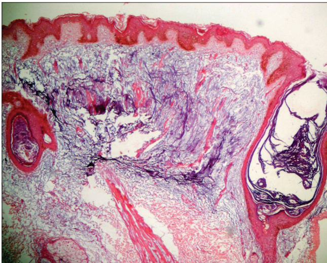
Figure 3: Dermal mucin highlighted (Alcian Blue, x200)

mucinoses have been seen as a side effect of anti-TNF- \alpha therapy in a psoriatic patient. [5] Furthermore, trauma as an inciting factor has been seen in two cases till date which later progressed to CFM. [4]