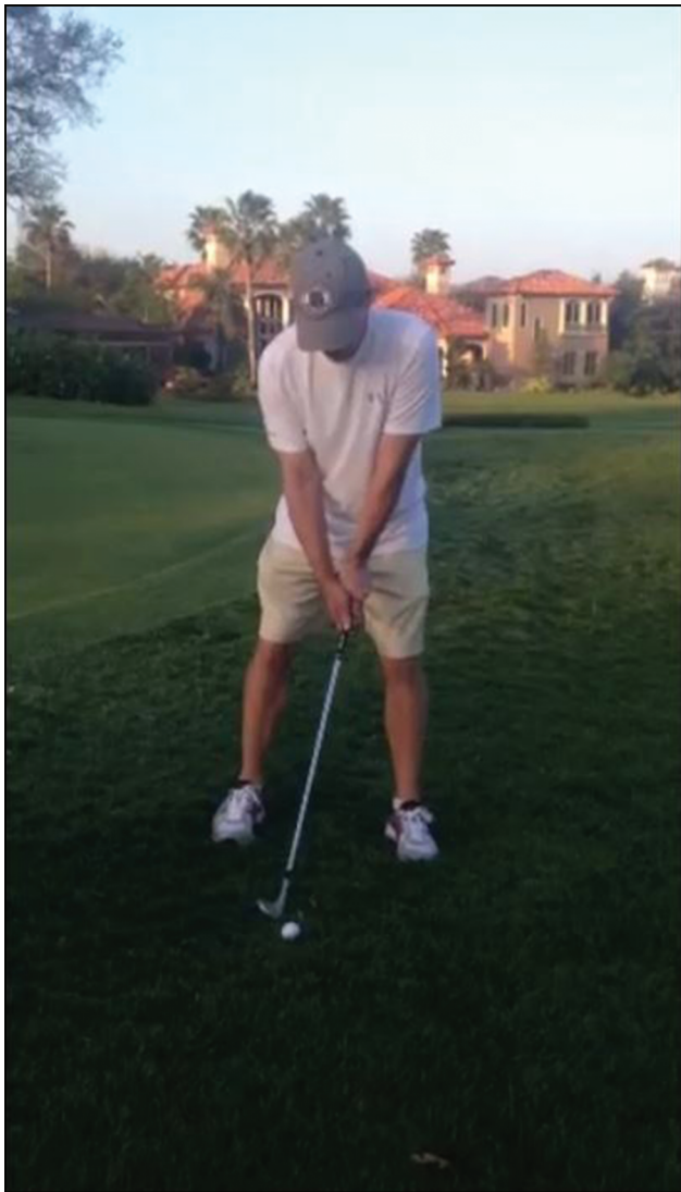
Video 1. Pre and Post DBS Video Illustration. Segment 1. This video illustrates the task-specific cervical dystonia manifested during swinging golf task. Dystonia manifests as sudden turning of head to the right with slight upward movement. Segment 2. This segment illustrates the remarkable improvement reported by the patient in about 6 months after surgery and programming. The patient is now able to resume competitive golf activities.

sternocleidomastoid muscle was noted and abnormal right turning of head (torticollis) was elicited specific to the swinging task employed during golf (Video 1). There was no abnormal posturing noted in the head or any other body part during rest, posture, and action tasks such as voluntary neck flexion, neck extension, side-to-side movement, and the finger-to-nose task for the arms. He underwent multiple medication trials including baclofen, tizanidine, clonazepam, and trihexyphenidyl. He was then treated with several rounds of onabotulinum toxin injections administered into the left sternocleidomastoid, right splenius capitis, right semispinalis capitis, and bilateral trapezius muscles (maximum dose 300 units). However, none of these treatments