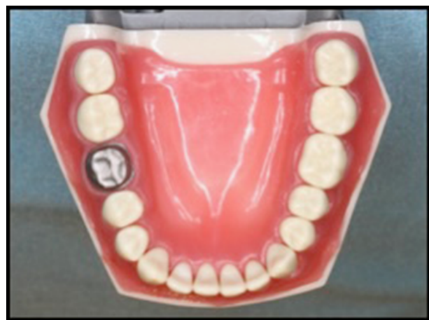
Figure 1 Master model fabrication with chromium-cobalt (CrCo) master die.