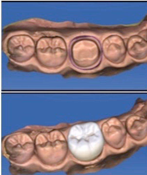
Figure 2 Cerec group cast scanning and crown designing.

Wieland CAM (Zenotec, Ivoclar Vivadent; Figure 3). The final restoration in all test groups was constructed using IPS e-max CAD (IPS e-max, Ivoclar, Amherst, NY, USA) lithium disilicate blocks in shade Vita A2. For the Control group, after complete scanning, the dyes were trimmed and prepared for the conventional full-contour wax-up. The putty index made before tooth preparation was used as a guide to standardize the latter process. The lost-wax technique was used to fabricate pressed lithium disilicate all-ceramic crowns (IPS e-max) in shade Vita A2.