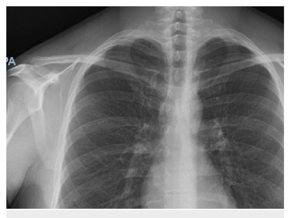
FIGURE 1: Chest x-ray on admission.

to COVID-19 and for management of infectious versus inflammatory colitis.