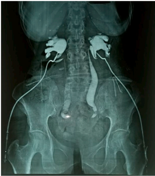
Fig. 4. A descending pyelography in a patient admitted for OA secondary to cervical cancer derived by bilateral percutaneous nephrostomy showing a clear stop in the passage of the contrast agent to the pelvic level making it impossible to raise the double-J stent.

medicine represented by self-medication by plants in addition to their ineffectiveness, these plants could have a harmful effects on the kidney functions aggravating thus the prognosis of the OA in these patients [11]. The age is a decisive prognosis factor in the management of these patients, the average age of our patients was 60 years old as well as Liang's but higher than the Efesoys's [11,12].