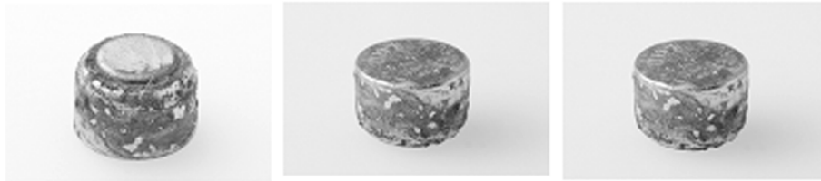
Figure 2 Button battery removed from the right nostril of the three year old child. After ten days in situ a relevant corrosion can be noted.

The increased dead space has to be considered, especially when small children are examined. During the actual scan the patient is left alone in the MRI scanner. Continuous clinical assessment (inspection, auscultation etc.) is not possible during the procedure and it has to be relied on monitoring systems. Emergency management is more difficult in the MRI environment. Access to the patient is extremely limited. Standard equipment (laryngoscope, defibrillator etc.) cannot be used. Transfer of the patient in a suitable area is time consuming and poses further risks like dislocation of the tube or loss of intravenous access. It also takes minutes after an emergency shutoff for the magnetic field to effectively decrease and furthermore leads to relevant expenses.