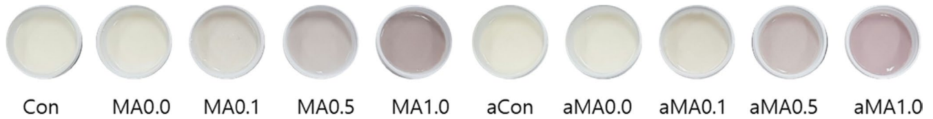
FIGURE 1 Photograph of the pudding fortified with mandarin melon berry ( Cudrania tricuspidata ) and aronia ( Aronia melanocarpa ) without and with acid treatment