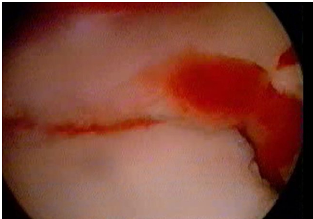
Fig. 2 Arthroscopic view of intra-operative reduction of a three-fragment glenoid fracture.

symmetrical ROM and a potential to return to previous activities after only three months and to full sporting activities at six months. The main explanation is that in those kinds of fractures, the ligaments are intact or partially injured and, to obtain fracture healing, it is only necessary to realign the fractured portions. Takase, Kono and Yamamoto 16 developed ARIF for Neer type 2 fractures using an artificial ligament with EndoButton (Smith & Nephew; Andover, Massachusetts) fixation on the coracoid, and a screw with a washer on the clavicle. With the technique proposed by Motta et al, 17 consisting of fixation with the AC TightRope (Arthrex; Naples, Florida), the biggest concern appeared to be age >60 years, which was also a key negative prognostic factor. It allows an improved view of the coracoid process and of the tunnel to be prepared, a prompt diagnosis of associated lesions in the shoulder joint, a better aesthetic outcome, a closed reduction without the need for a delayed hardware removal, better pain