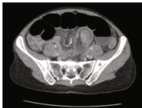
FIGURE 3: Computer tomography scan in the axial plane demonstrating multiple loops of dilated loops of the small bowel with a transition point within the left iliac fossa with the characteristic "target" sign suggesting high-grade small bowel obstruction likely secondary to intussusception.

Inflammatory markers continued to trend upwards, abdominal pain worsened, and constipation continued. Abdominal CT scan was ordered which revealed high-grade distal SBO with transition point in the left iliac fossa and signs suggestive of ileo-ileal intussusception (Figures 2 and 3).