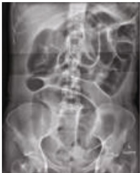
FIGURE 1: Abdominal X-ray image demonstrating multiple dilated loops of the small bowel.