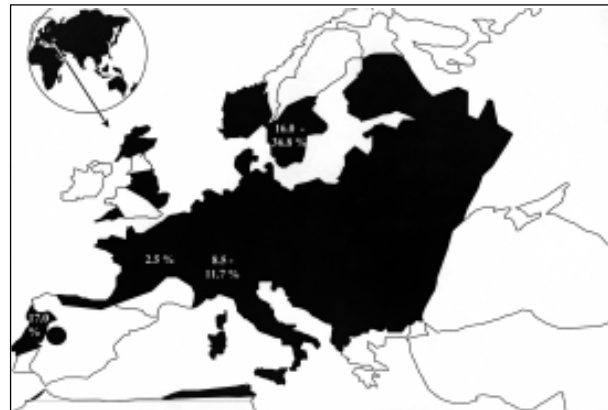
Figure 1. Map of Europe showing the distribution of Ixodes ricinus (1). The areas where I. ricinus is prevalent are shaded in black and the prevalence of R. helvetica in I. ricinus , where estimated, is indicated.

In this report, we describe a human infectious syndrome in which specific seroconversion against R. helvetica occurred. We also present the results of a serosurvey on rickettsioses conducted in Alsace (eastern France) among forest workers,