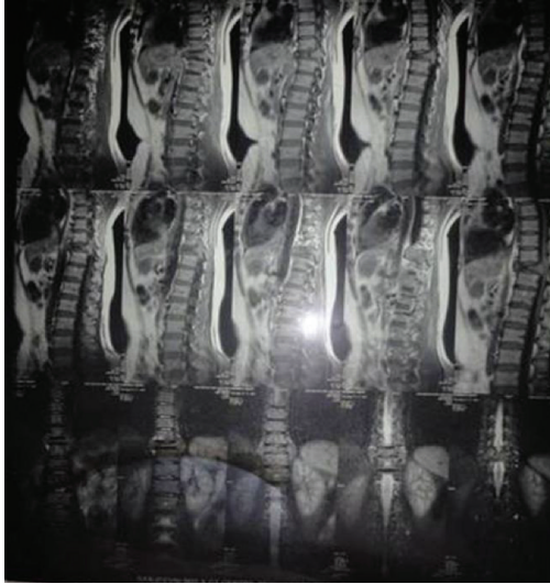
FIGURE 3: MRI of dorsolumbar spine showing complete marrow replacement of vertebral body and posterior elements with associated homogeneously enhanced soft tissue component in adjacent pre- and paravertebral space and in ventral and dorsal epidural spaces leading to severe cord compression and spinal canal stenosis.

of neuropathy should be considered, such as the effects of chemotherapy. Spinal cord compression is a rare presentation of non-Hodgkin's lymphoma.