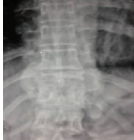
FIGURE 1: X-ray dorsolumbar spine showing vertebra plana of T10 vertebra. Disc space is well maintained.

Histologically, the tumor consists of aggregates of malignant lymphoid cells replacing marrow spaces and osseous trabeculae. The cells contain irregular or even cleaved nuclei.